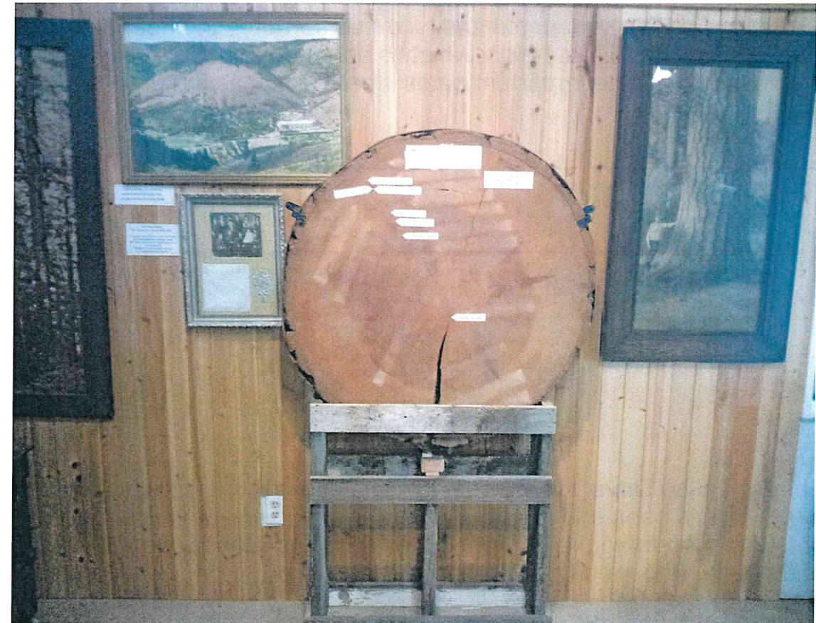
New Display in Carriage House Cross-cut log slice from the J. Neils Lumber co. was given to the museum in 2023 by Lupine Columbia Holdings LLC.

Honoring the Timber Industry of Klickitat County; J. Neils Lumber Company